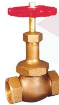
ITEM CODE # GM - 502

S.S. Working Parts, Hand Wheel Operated.