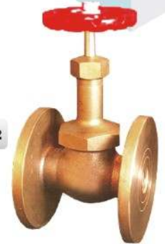
ITEM CODE # GM - 503