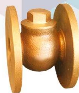
ITEM CODE # GM - 509