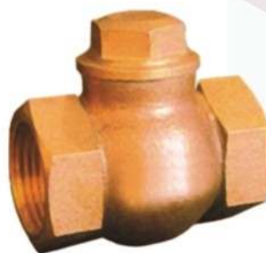
ITEM CODE # GM - 508

Screwed in bonnet, Integral seat, Guided Plug type disc.